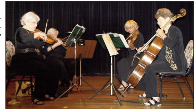
Pasadena Community Orchestra String Quartet provided the evening's entertainment.