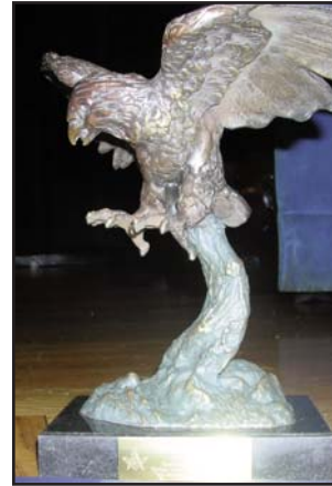
The Carved Eagle that was presented to the honorees from Wisdom Lodge.