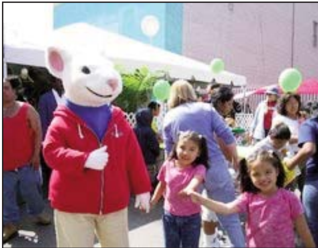
The Easter Bunny made a surprise visit to the Midnight Mission.